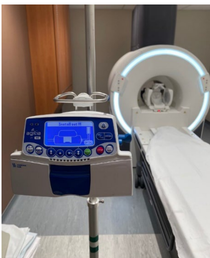
Figure 1. Room setup with non-MRI-compatible pumps.